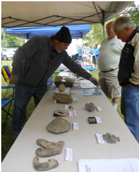
Fossil Section Exhibit at the Adirondack Mountain Club Outdoor Expo June 14, 2014 at Mendon Ponds Park.