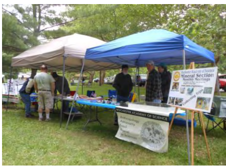
Rochester Academy of Science Exhibit at the Adirondack Mountain Club Outdoor Expo June 14, 2014

at Brockport when September rolls in. This will be posted online and sent to Section newsletter editors.